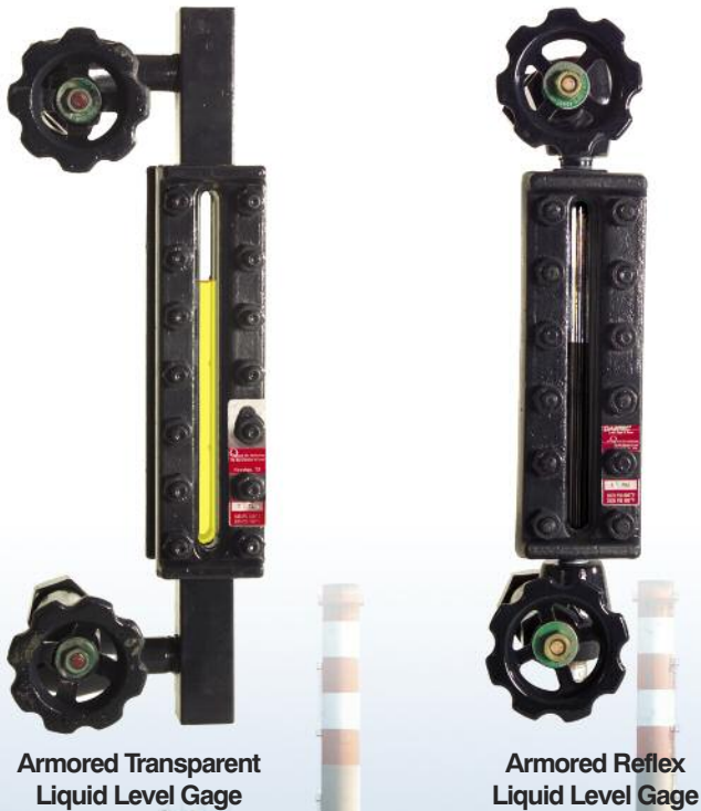
Armored Transparent Liquid Level Gage