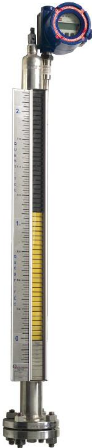
Magne-Trac with MTLT-5000 transmitter