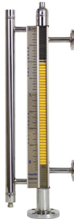
Magne-Trac Level gage with guided wave transmitter ready