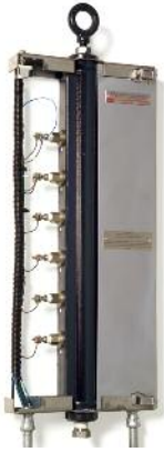
LT-501 Column with 801 Probe